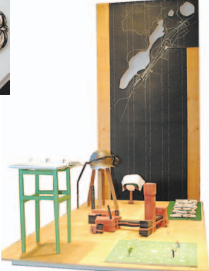
Jason Hallows: Ore. A narrative about a mining town in Northern Ontario where the artist used to live.

The gallery is at 1 North Square in the Cambridge Library and Galleries building in the downtown Galt area of Cambridge. For more information, phone 621-0460.