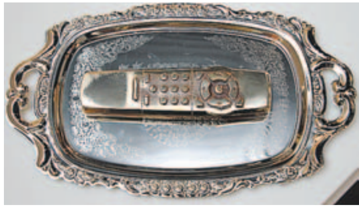
Zeke Moores: Controls.